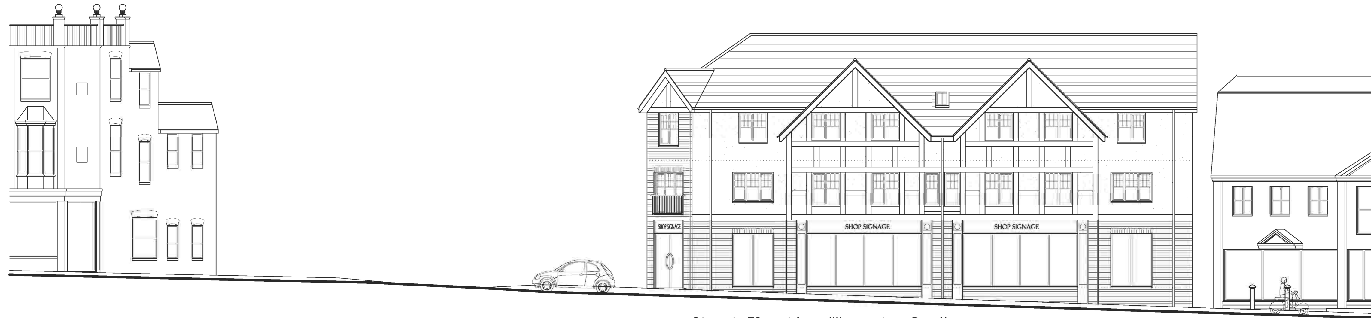
Street Elevation (Worcester Road)

All dimensions to be checked on site Do Not Scale This drawing is copyright Rev. Description Drawn Chk Date A Update following meeting with Planner-- 25-08-05 12.09.05 B Final Update. 14.09.05