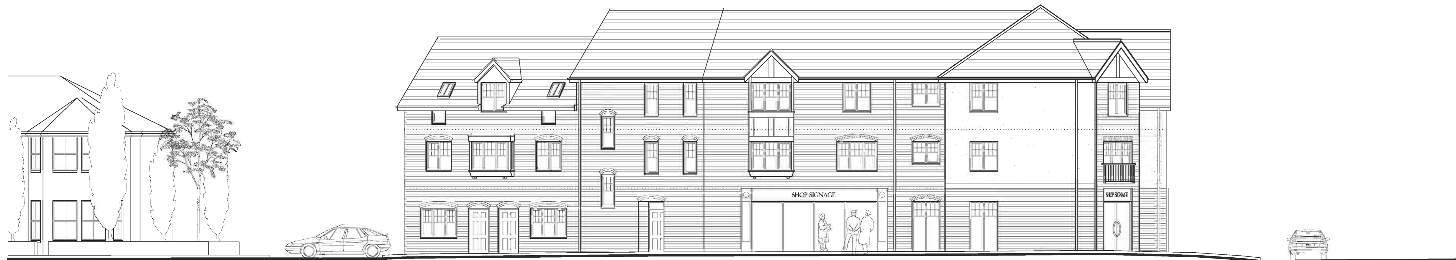
Street Elevation (Hampden Road)