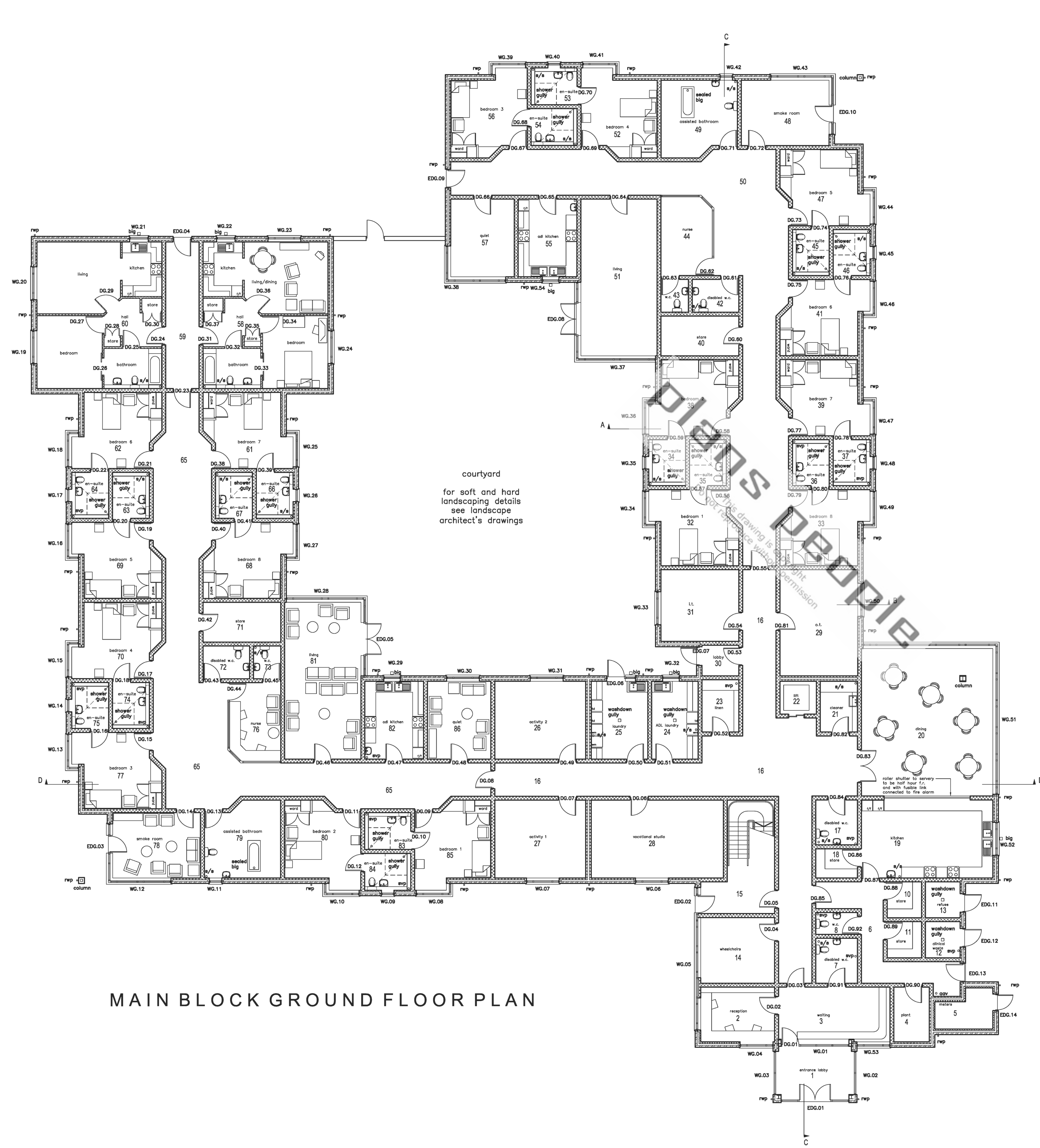
MAIN BLOCK GROUND FLOOR PLAN